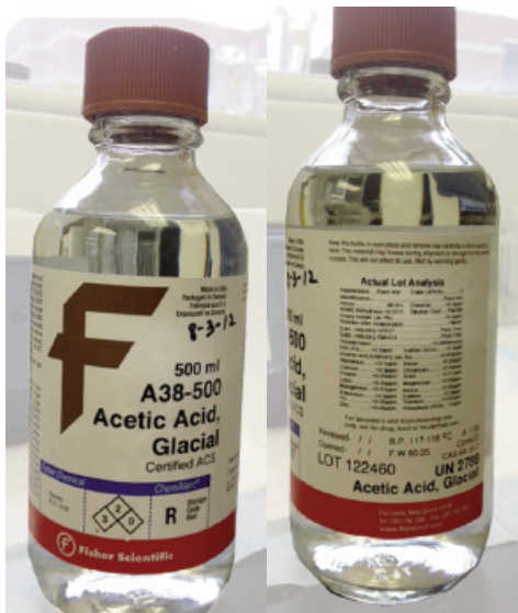
Figure 1. Label on glacial acetic acid bottle, front (L) and back label panels (R).

Remove from stock. Remove glacial acetic acid from the pharmacy, discard it safely, and replace it with vinegar (5% solution) or commercially available diluted acetic acid 0.25% (for irrigation) or 2% (for otic use). Limit availability to these concentrations only. Ensure that the acid is not stored in clinical areas such as the OR, clinics, physician practice sites, ambulatory surgical centers, and other procedural areas. Glacial acetic acid has no use in its current form in clinical medicine.